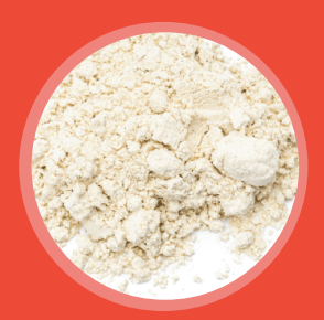
INSTANTIZED WHEY PROTEIN ISOLATE

Rich in amino acids that support immunity and the glutathione pathway*