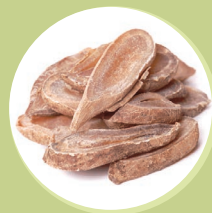
Curcumae Radix Extract

Supports healthy liver function and counters the effects of stress*