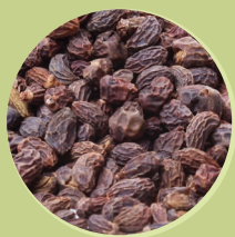
Ligustrum Lucidum Extract

Supports liver health and immune function*