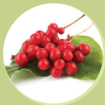
Fructus Shisandrae Extract

Provides liver, mood, and immune support*