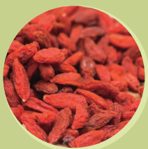
Lycii Fructus Extract

Revitalizes the body and defends against free radicals*