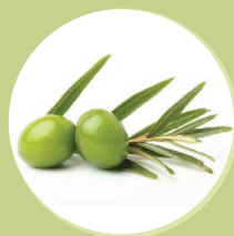
Olive Leaf Extract