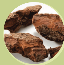
Pine Bark Extract

Supports cognitive function and helps combat oxidative stress*